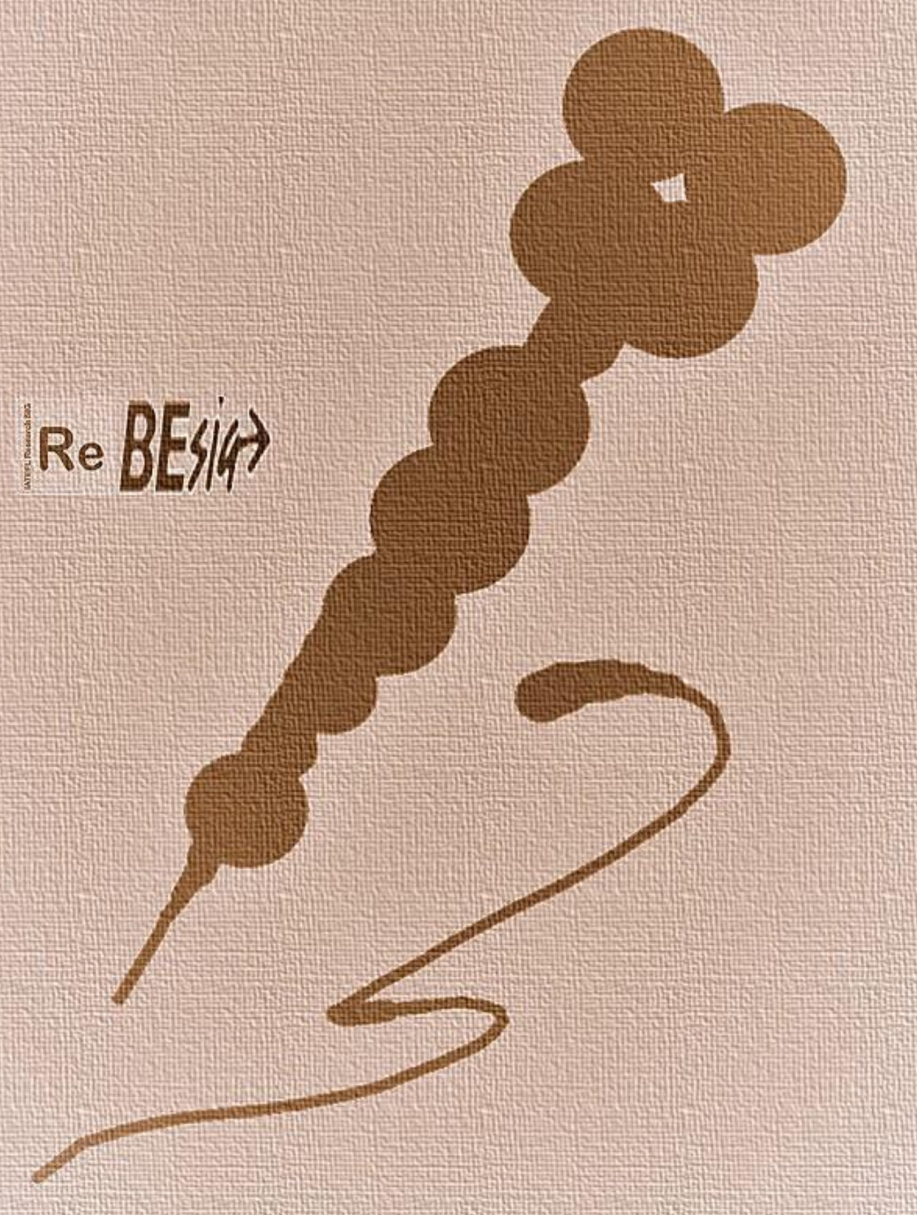
Edited by the LATEFL BESIG Editorial Team