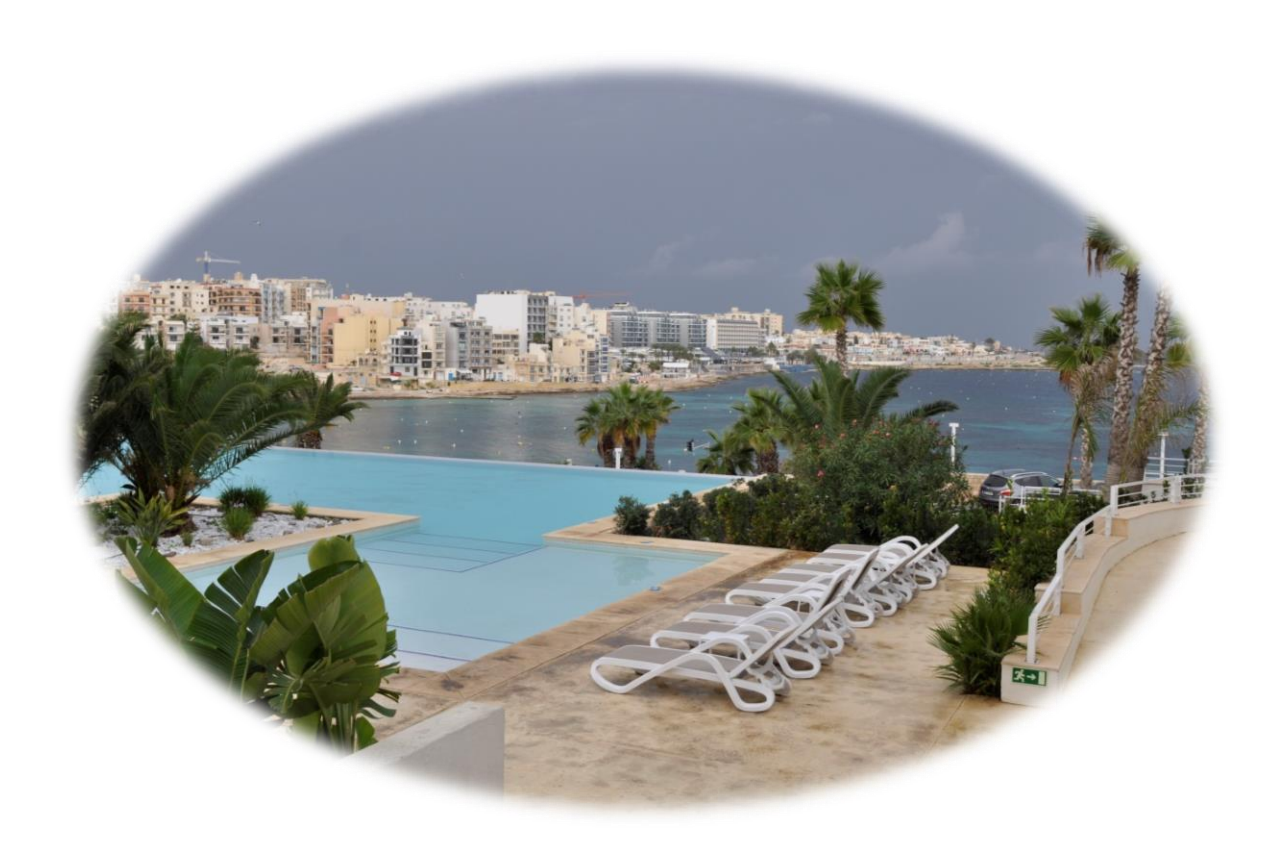
Farewell Salina Bay. Thanks for having us!